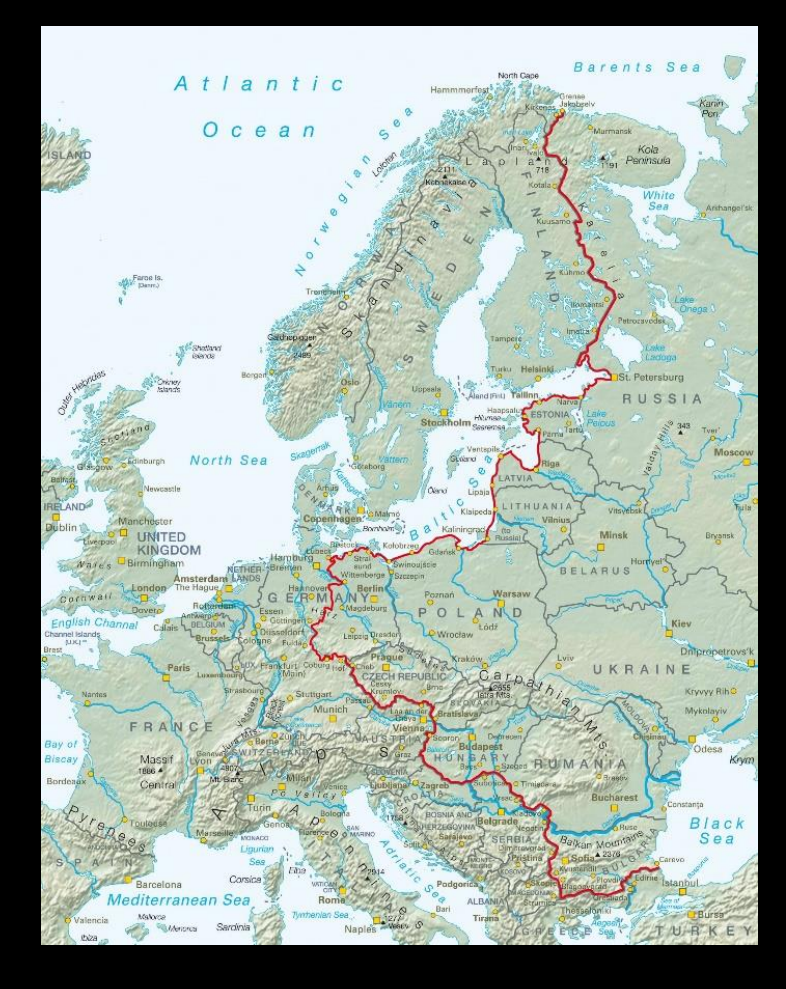
Iron curtain remains at South Moravia border