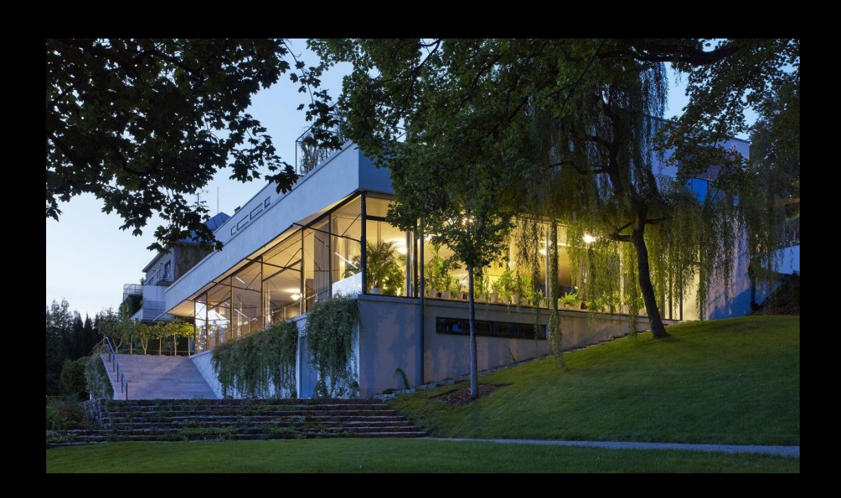
Löw - Beer villa